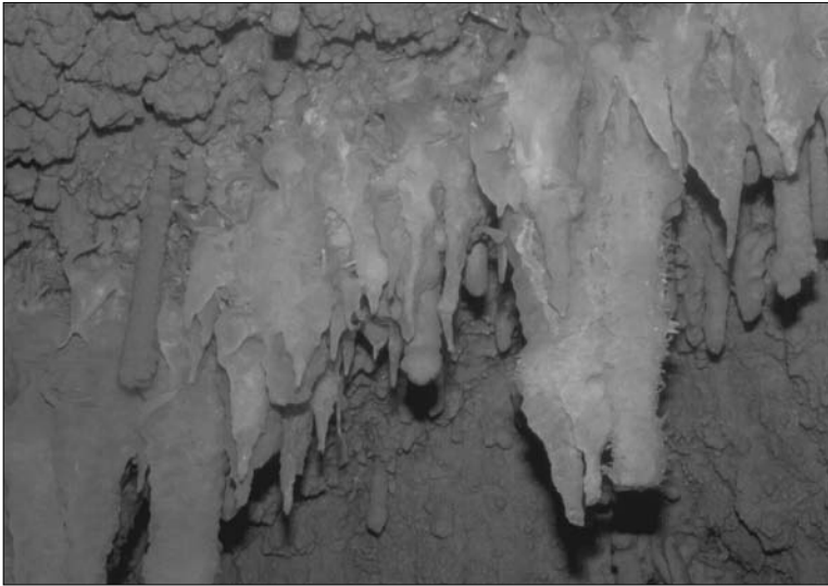
Fig. 6 – Complex speleothems in Wadi Sannur Cavern..