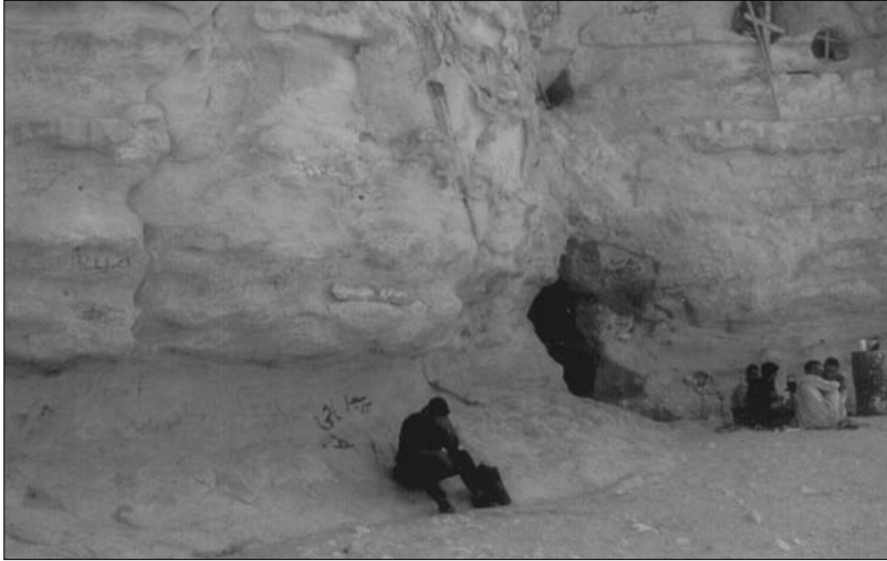
Fig. 3 – Entrance of St. Anthony's Cave and nearby karstic features.

Several significant karstic features have been identified on the north end of the Southern Galala Plateau in the hyperarid Eastern Desert. Here, St. Anthony's Cave is very small but significant geologically as well as culturally (Halliday, 2000, 2001). It is a fossil resurgence cave in a comparatively dense Eocene limestone. The entrance is about 2.5 m high and 1 m wide (Fig. 3). A floor of nearly colorless flowstone - possibly Egyptian alabaster (see below) - extends outward as a shelf.