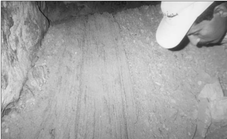
Fig. 1 – Bat Cave, Wadi Degla Protected Area. Stratified cemented fills from post-karstification marine transgressions.

The Mokattam karst is formed on a dissected limestone plateau on the eastern fringe of metropolitan Cairo. Here, typical karstic pollution and subsidence problems have necessitated broader studies than in most Egyptian karsts (e.g., El-Ramly, 1997). In addition, recent designation of the Wadi Degla Protected Area (the equivalent of a national monument in the USA) has focussed attention on small but remarkably varied caves of phreatic origin, which are the principal expressions of its karstification. One is a typical tubular conduit cave. Another descends steeply to a vertical shaft where initial reconnaissance had to be halted. This karst has been subjected to repeated marine transgressions since onset of speleogenesis (Fig. 1). A sequence of partially cemented stratified littoral fills is present in several of these caves (Halliday, 2000a) (Fig. 2).