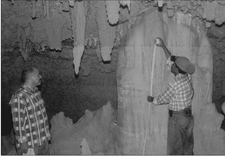
Fig. 5 – Flood lines in Wadi Sannur Cavern.