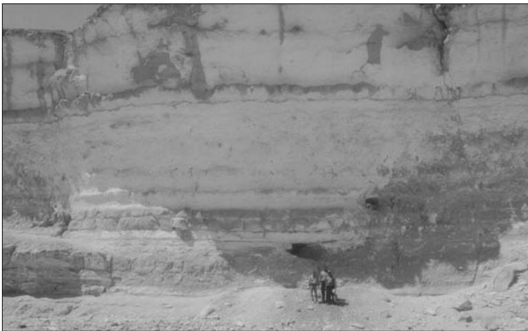
Fig. 2 – Stratigraphic section, Wadi Degla Protected Area. Two entrances of Beetle Cave are included.